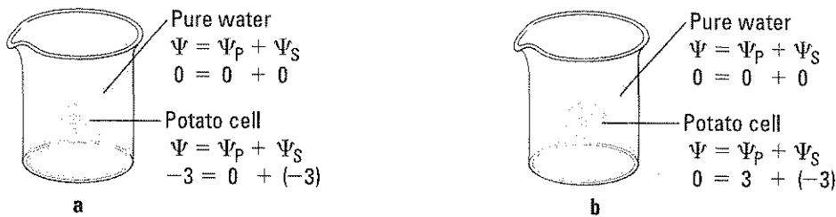
Figures 1a-b. Plant cell in pure water. The water potential was calculated at the beginning of the experiment (a) and after water movement reached dynamic equilibrium and the net water movement was zero (b).

Over time, enough positive turgor pressure builds up to oppose the more negative solute potential of the cell. Eventually, the water potential of the cell equals the water potential of the pure water outside the cell ( \psi of cell = \psi of pure water = 0). At this point, a dynamic equilibrium is reached and net water movement ceases (Figure 1b).